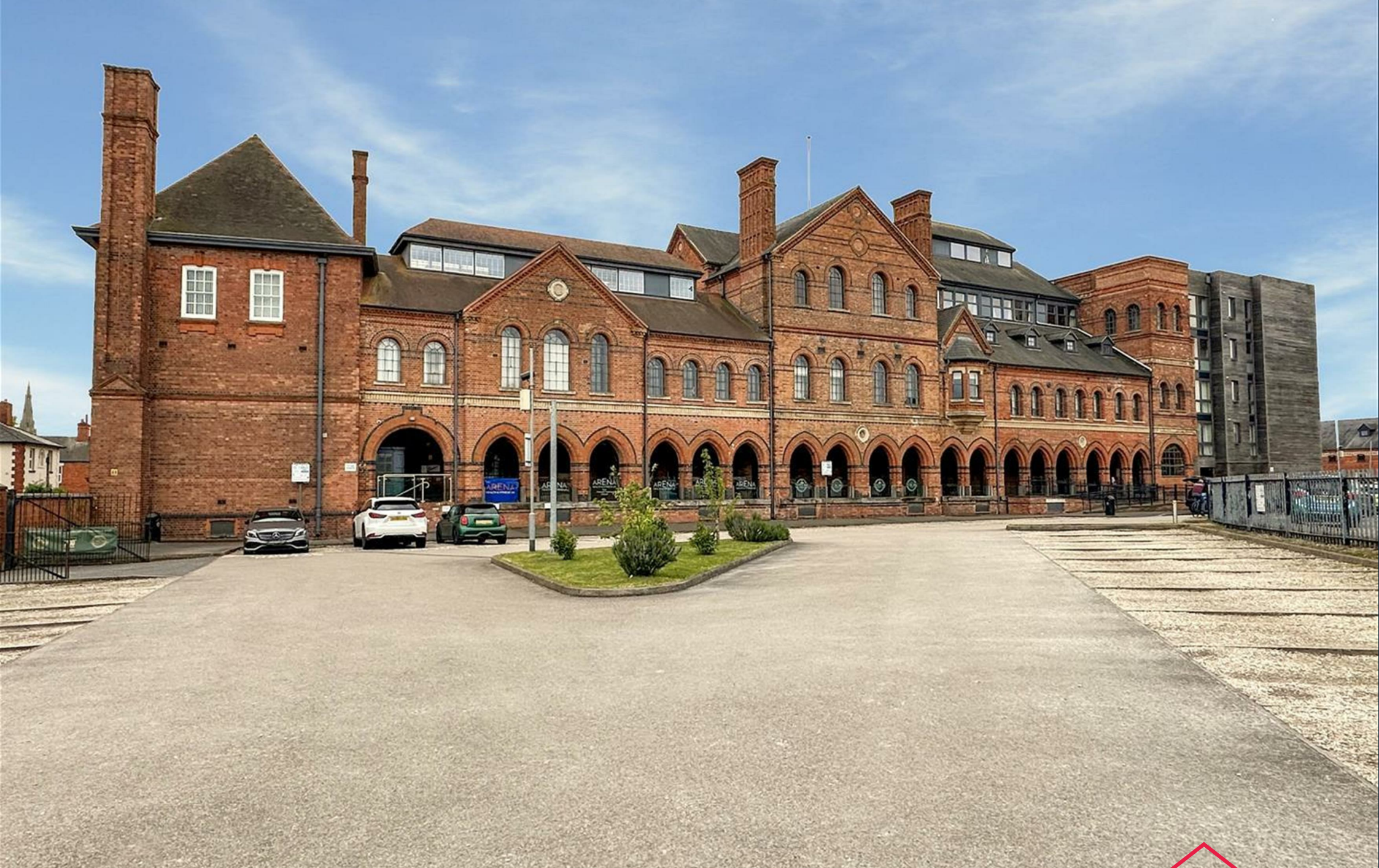
The Tankard Building, Warwick Brewery, Newark